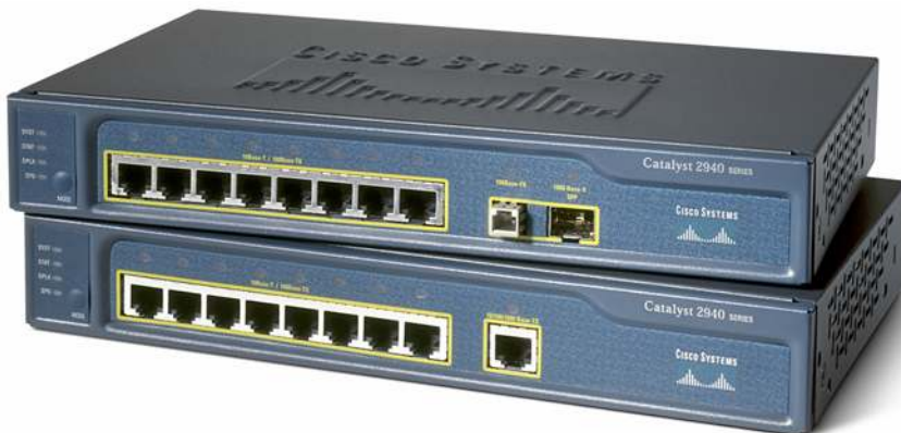
Figure 1. Cisco Catalyst 2940 Series Switches

The Cisco Catalyst 2940 Series is extremely easy to set up and configure via Cisco Express Setup, a simple Web-Based setup utility. For more advanced configuration and ongoing management, the Cisco Catalyst 2940 Series has a console port and supports remote management protocols such as Telnet, Simple Network Management Protocol (SNMP), as well as Cisco Network Assistant, which is a free PC-based network management application. Combine this with the rich functionality of Cisco IOS® Software, and these switches provide comprehensive functionality and manageability for classrooms, conference rooms, or other very small workgroup environments. In addition, the Cisco Catalyst 2940 Series is supported by a limited lifetime warranty. The Cisco Catalyst 2940 Series switches provide the lowest total cost of ownership in their product class with their durable design, enhanced security, simple installation and management, and award-winning Cisco support.