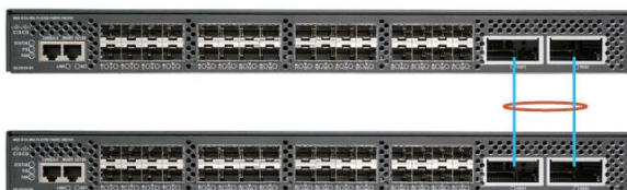
Figure 2. Cisco MDS 9134:Two Cisco MDS 9134 Switches Stacked Using 10GBASE Copper CX4